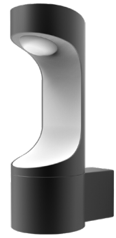
SETH1 (Wall Light)